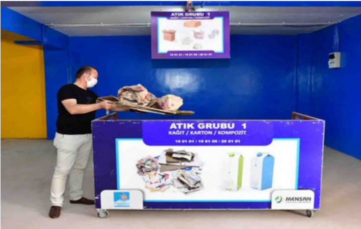
Waste Collection Facility (2022)