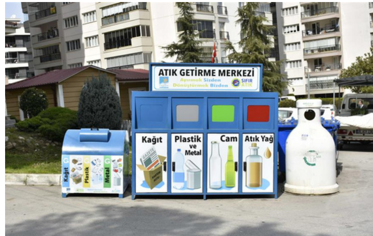
Mobile Waste Collection Center (2022)