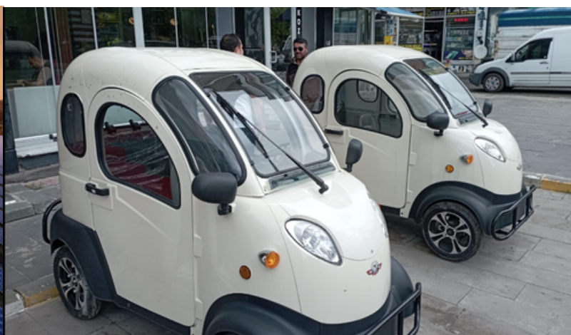
Inclusion of Electric Vehicles in Ardahan Municipality ( 2022)