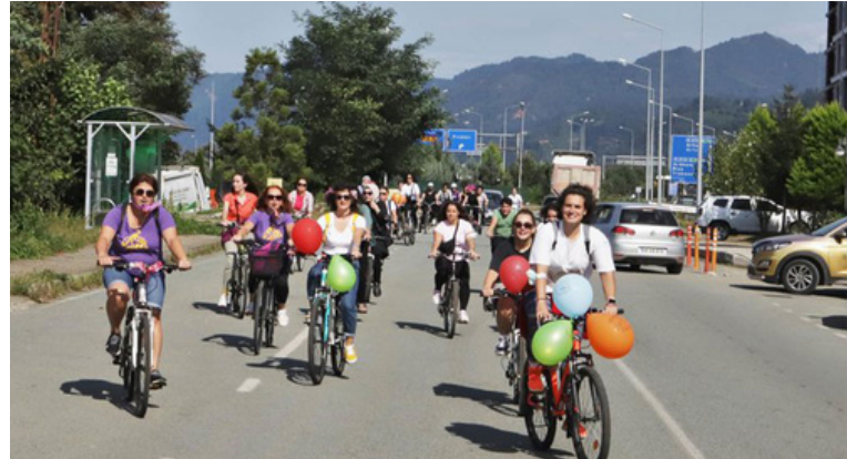
Sustainable Urban Mobility Project ( 2023)