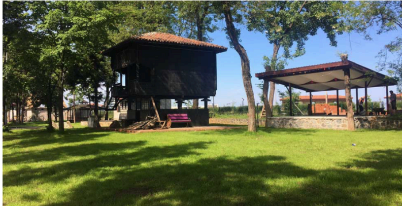
Urban Greening Project ( 2022)