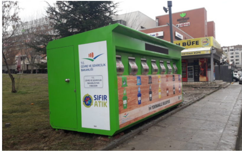
Collection of Mobile Waste Project (2020)