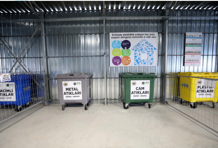
Collection of Solidwaste Project (2020)