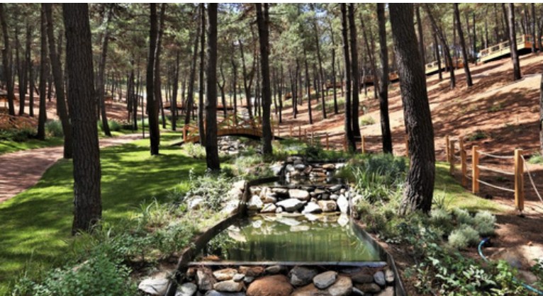
Sultan's Grove Project (2023)