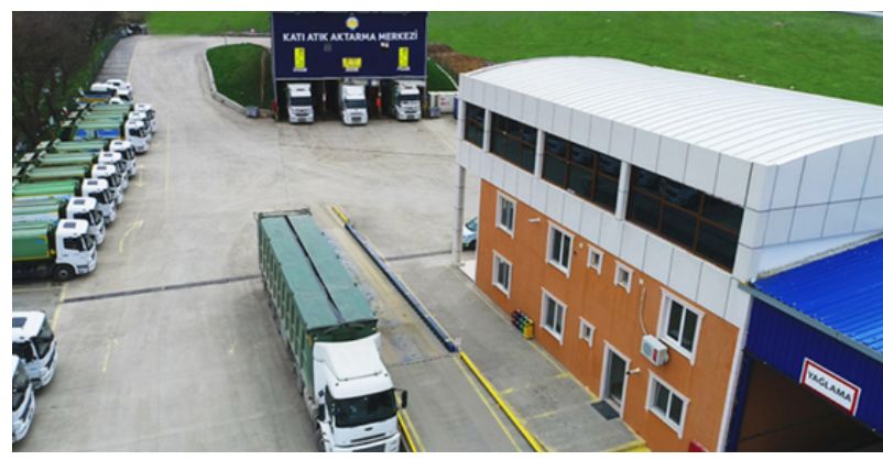
Solid Waste Transfer Center( 2023)