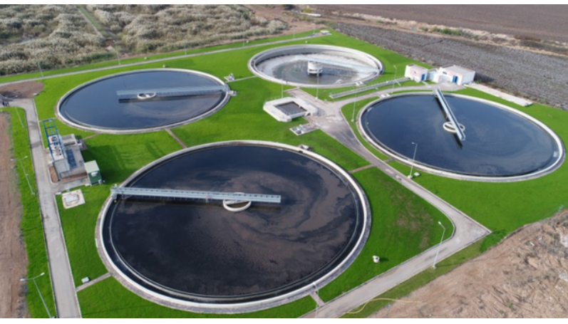
Wastewater Treatment Plant (2020)