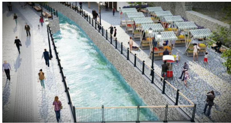
Sustainable Tourism Project ( 2022)