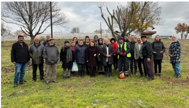
Sustainable Agriculture Project (2022)