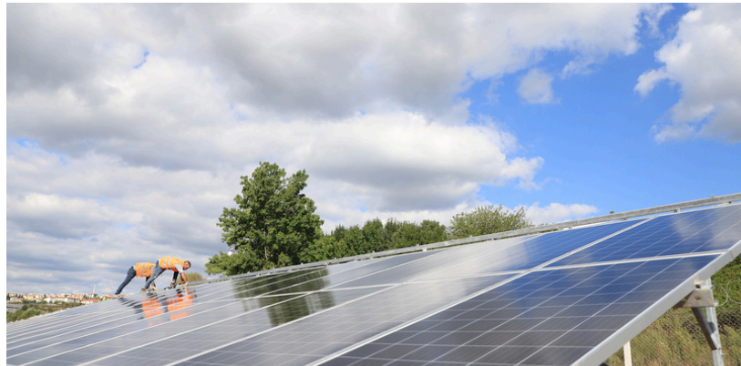
Solar Panel Station (2022)