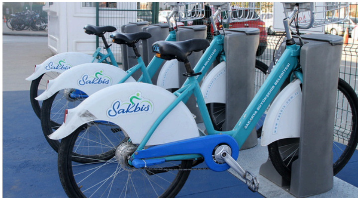
Eco-Mobility Project (2020)