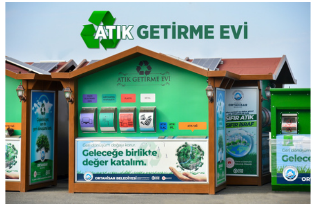
Solid Waste Collection Project (2022)