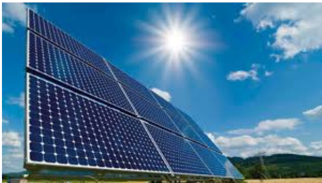
Solar Panel Project (2024)